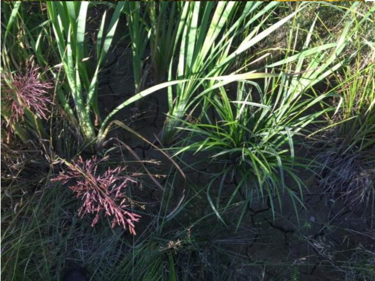
Cattails growing in seasonably dry wet area. This would be defined as a Wetland by Chapter 29. Applicator would need to buffer 25 feet for broadcast application.